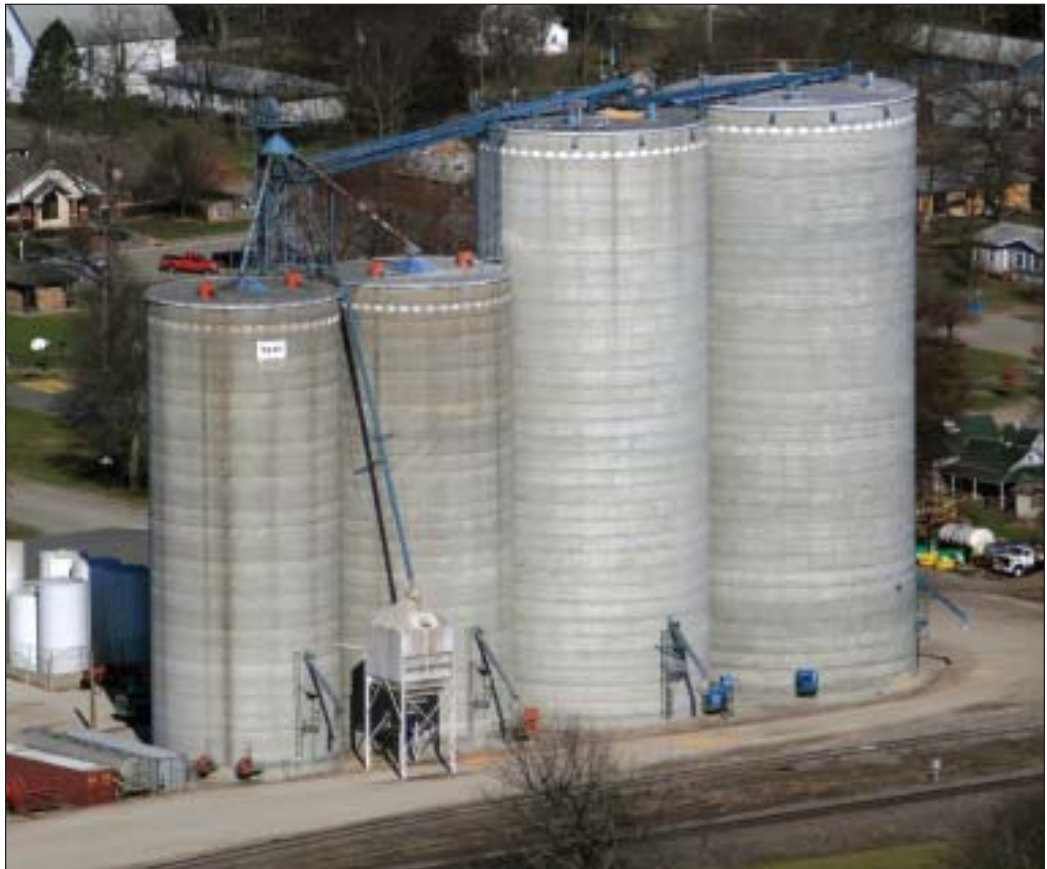
Jumpform concrete annex operated by LeRoy Coop Association at LeRoy, KS, with new 340,000-bushel McPherson tank at the right end.

LeRoy Coop Association is celebrating its 50th anniversary in 2010 with upgrades at two of its three locations.