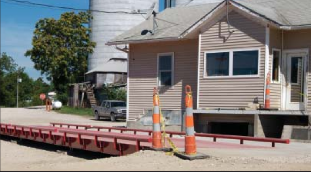
New 70-foot pitless Rice Lake truck scale at LeRoy Coop's Westphalia, KS location.

tank, and Frisbie Construction Co. Inc., Gypsum, KS (785-536-4288), as millwright. Construction on the $1.1 million project began at the end of June 2009, and the tank was ready for use by mid-September.