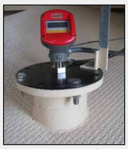
Scanner mounted on existing flange. using an adapter plate.

elScanner MV model – is helpful when used in material prone to sidewall buildup and bridging, where there are points in the bin that are lower or higher than the majority of the bin contents. Calculating volume after an empty or fill cycle, when there is a "cone down" or "cone up" can also be more accurate when multiple point measurement is used. Had a single measurement been taken, bin volume estimates could be significantly higher or lower than the actual volume.