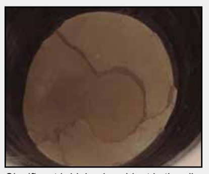
Significant bridging is evident in the silo.